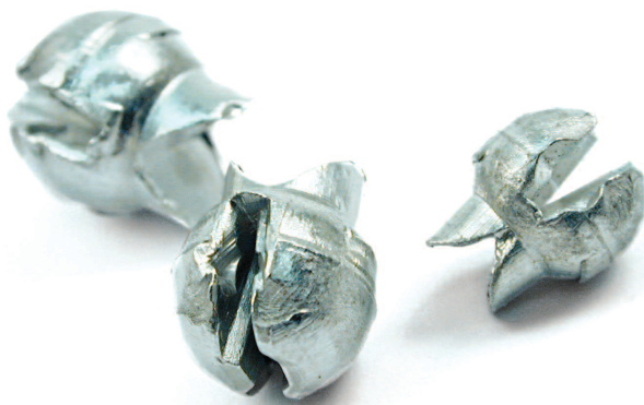
Tin split shot like this is one lead-free alternative available.

For more information, visit the MPCA Web site at www.pca.state.mn.us/sinkers/ . You can also refer back to the related article "Get the Lead Out!" that ran in the July/August 2008 issue of From Shore to Shore . It can be accessed online at www.shorelandmanagement.org/downloads/july_aug_2008.pdf . ■