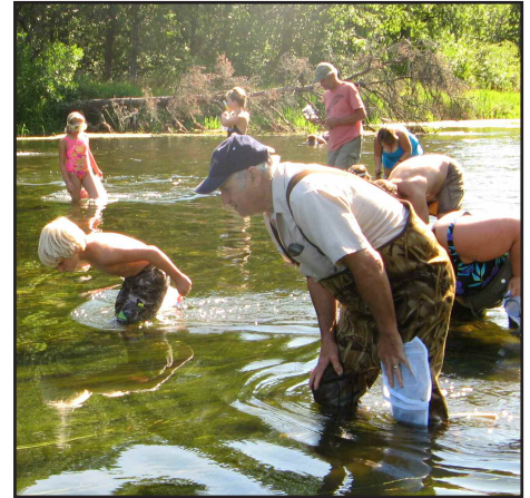
Volunteers and professionals working together to locate mussels.

The first survey site was located near a historic button-making factory, an area that had provided thousands of mussel shells to make buttons. Natural resource professionals and Minnesota Waters were recruited to help with survey protocol and species identification. Few live mussels were found, possibly because a state campsite is nearby and the resultant foot traffic may have neg-