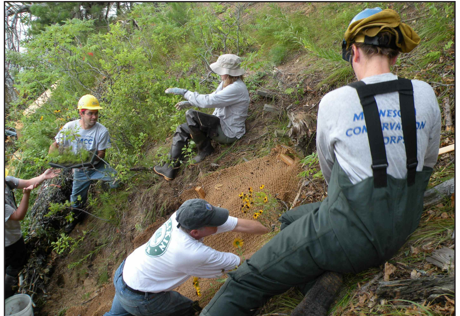
Working on a steep sandy slope is no easy job, as seen in this photo taken by WAPOA volunteer Sarah Egan

ly an extra incentive with professional advice, help and materials. Four siblings co-own the property and winning the 2009 shoreland restoration prize allowed them to begin the first 180 feet of their shoreland restoration project.