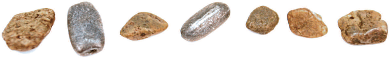
Examples of lead tackle inadvertently picked up and ingested by loons

Reprinted (Get the Lead out for the Fishing Opener) with permission from the Minnesota Pollution Control Agency.