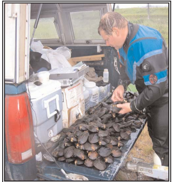
This DNR mussel researcher is sorting mussels by species. After they are identified, they will be measured and recorded to create a list of mussel species in the water body.

Native people used mussels for food, jewelry, and utensils. More recently, shells were used to make buttons for clothing, and they are still used in some places to make cultured pearls. Because mussels reproduce slowly, over-harvesting decimated many populations. Today it is illegal to harvest mussels in Minnesota.