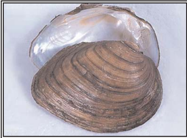
This giant floater is just one of Minnesota's many native mussel species.

Minnesota's mussels have interesting names like spectaclecase, pistolgrip, heelsplitter, and warty-