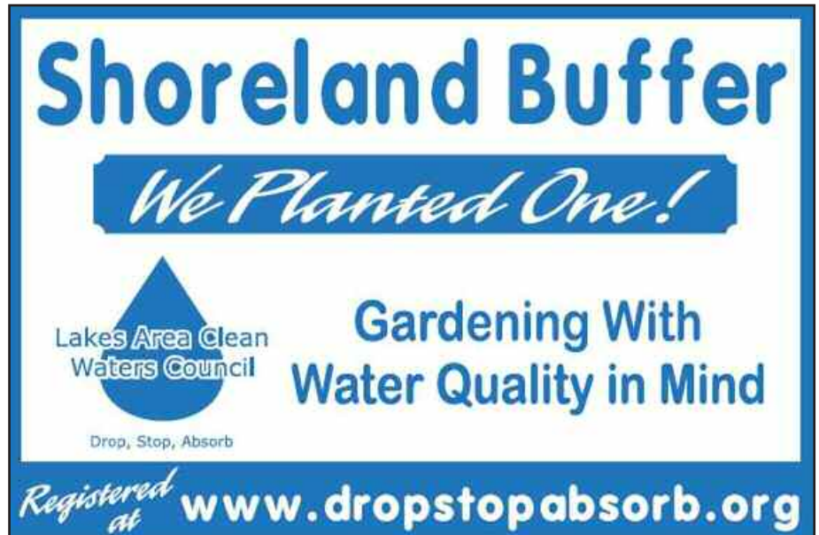
Example of a sign available for property owners to display.

2008, and you will find a membership that has expanded to 42 and a new Web site. If you visit www.dropstopabsorb.org ,