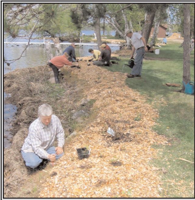
Installing native plants for wetland and upland buffer at Wildwood Resort.

Itasca Soil and Water Conservation District is sponsoring University of Minnesota Extension Shoreland workshops and buffer project cost-share over the next two years to promote shoreland stewardship in Itasca County. Pictured are several participants of the September 2005 Introduction to Shoreland Landscaping Workshop learning to install a