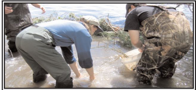
Planting bulrush for wave break and fish habitat.

Participants of Extension's May 24, 2006 Erosion Control Workshop take their knowledge of bioengineering gleaned in the morning classroom session into the field to stabilize failing slopes of the Rapid River near Baudette. The steep and slippery clay slopes and fluctuating water level, common