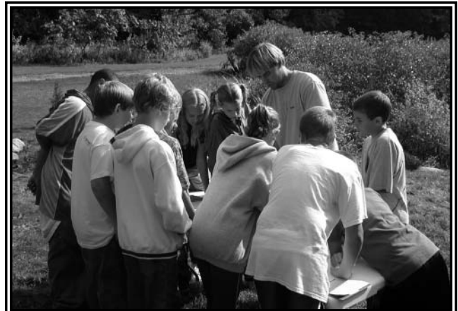
Students participating in the program.

programs like this one all over the state. To find out if programs like this are available in your watershed or local area – contact your Extension Regional Center. If you are a part of lake or watershed association – there may be ways for you to support activities like these or get involved yourself.