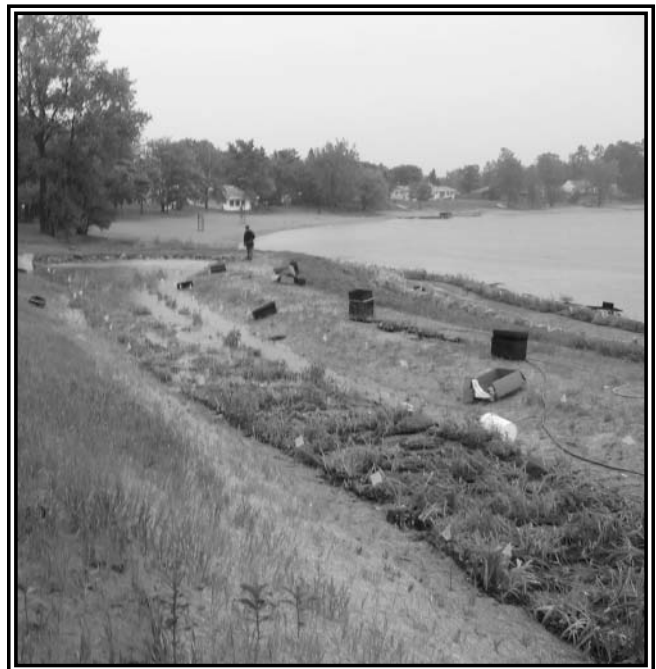
Filtration pond during first rain event. (just after planting!)