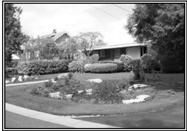
Rain Garden.

Often several rain gardens are designed into the home landscape. For rooftop runoff, generally one rain garden is placed at each down spout at low points in the lawn. Each rain garden should be about one-third the size of the area that is being drained. For example, at a 3000 square foot home with four down spouts, each rain garden would be approximately 250 square feet. In sandy soil the size can be smaller, but for heavy clay a larger area may be required. Rain gardens may be built applying these same concepts to control runoff from other impervious surfaces, such as driveways and sidewalks.