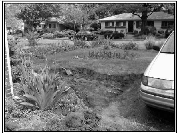
Rain Garden under construction.

The rain garden depression should be placed 10 feet or more away from foundations, so seepage doesn't occur. Remember to always call the Digger's Hotline (800-242-8511) before digging to prevent cutting into an electrical line or cable.