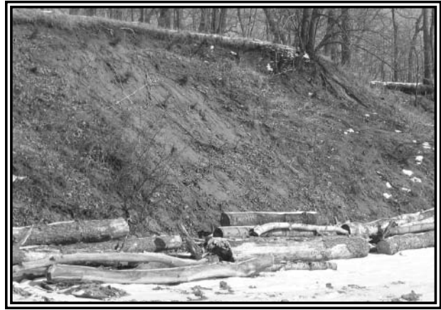
Logs for shoreline stabilization