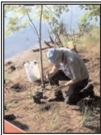
Shoreland buffer planting on Shirt Lake.

The Shirt Lake Association (Aitkin County) hosted a workshop on Shoreland Planting and an Introduction to Shoreland Landscaping this summer in Deerwood. Participants received both classroom design instruction and hands-on planting experience including aquatic, wetland and upland plants. A rain garden was planted at one site to capture and prevent storm-water from entering the lake. ■