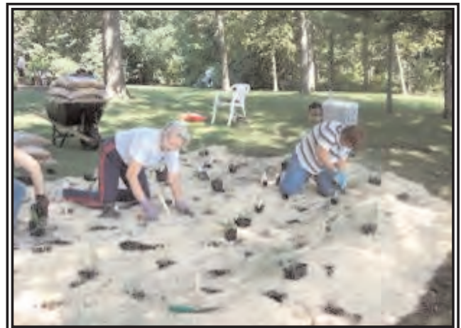
Installing a rain garden.