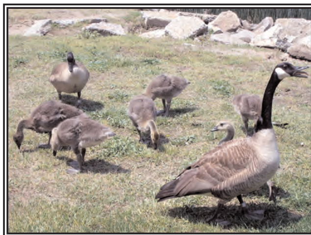
Adult geese and goslings can cause problems for lawns.

So what can you do if geese have moved in with you? Probably the simplest solution is to try and see the world from a goose's viewpoint. Geese are often nuisances because they are looking for the same real estate as humans – nearby water, lots of grass (their preferred food source), and few places where predators can hide. As our shorelines become more developed and urbanized, we create more and more habitat for geese, but there is good news – some simple solutions not only reduce goose problems but also help protect the water quality of our lakes and streams. Reducing the size of your lawn and increasing the native shrubs and perennials near the water's edge will